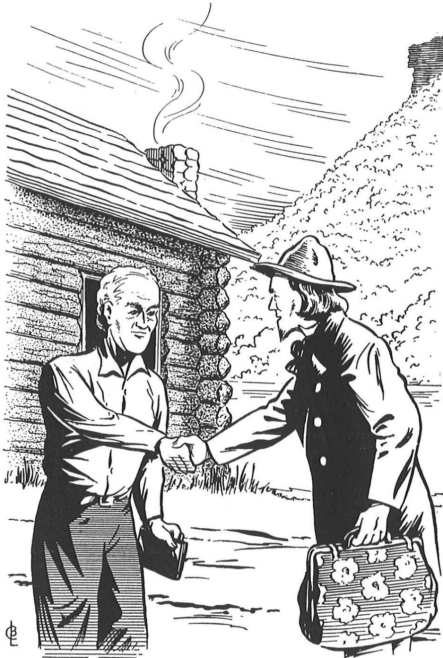
The Poet comes to visit Ernest

4) The Great Poet . This was the best candidate yet. Ernest really thought he might be the one. He was a very wise and very kind man. But when Ernest studied his features and compared them with those on The Great Stone Face, he knew that the prophecy was not fulfilled.