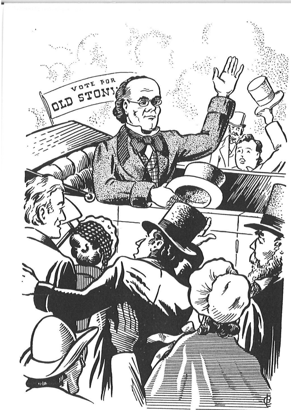
The coming of Old Stony Phiz, the politician

The rich man, the mighty general, the famous politician—each one seemed very promising, but each one failed to be the one that the legend had promised. Each one failed to bear the image of The Great Stone Face.