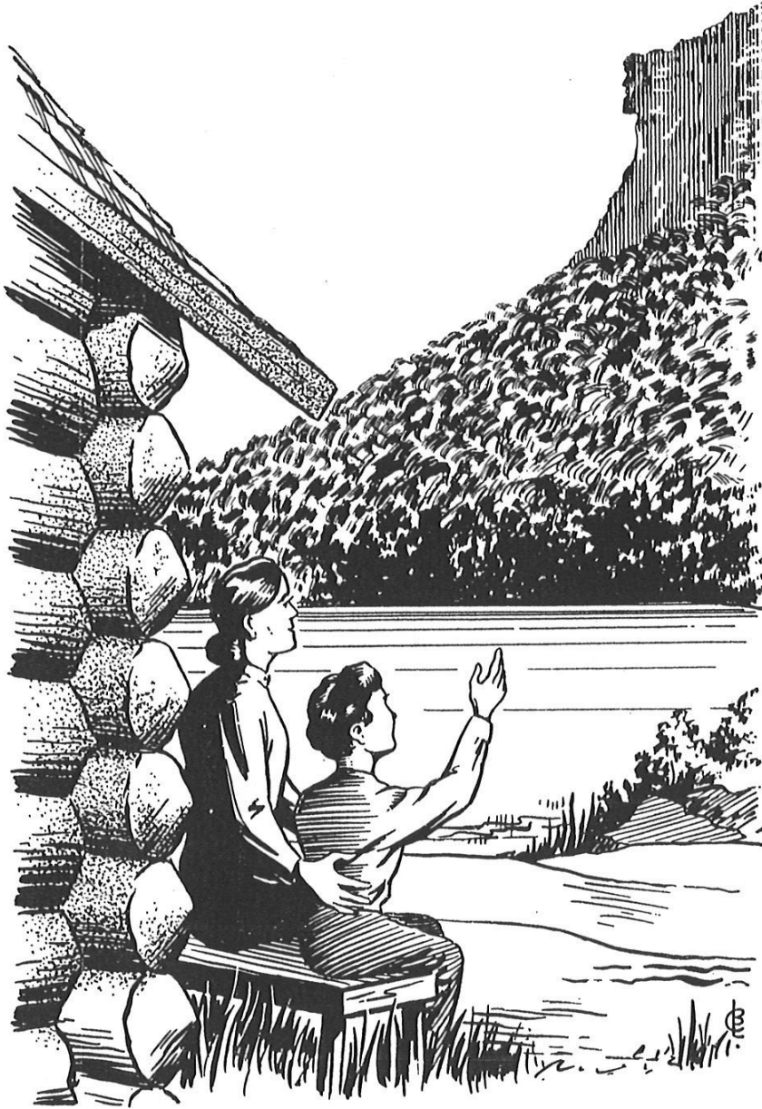
Ernest hears the prophecy of the Great Stone Face

We recommend you read this entire short story. Whether the author intended it or not, the story is a beautiful illustration of 2 Corinthians 3:18. Here is the story summarized very briefly (the illustration are from the edition of this short story published by Sherwin/Dodge Printers, and used by permission).