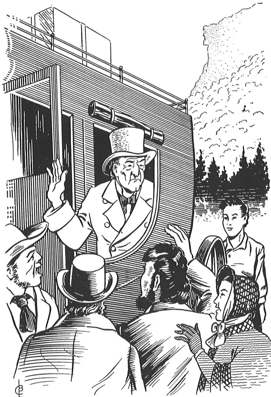
The coming of Gathergold, the miser

1) Mr. Gathergold the miser, a very rich man.