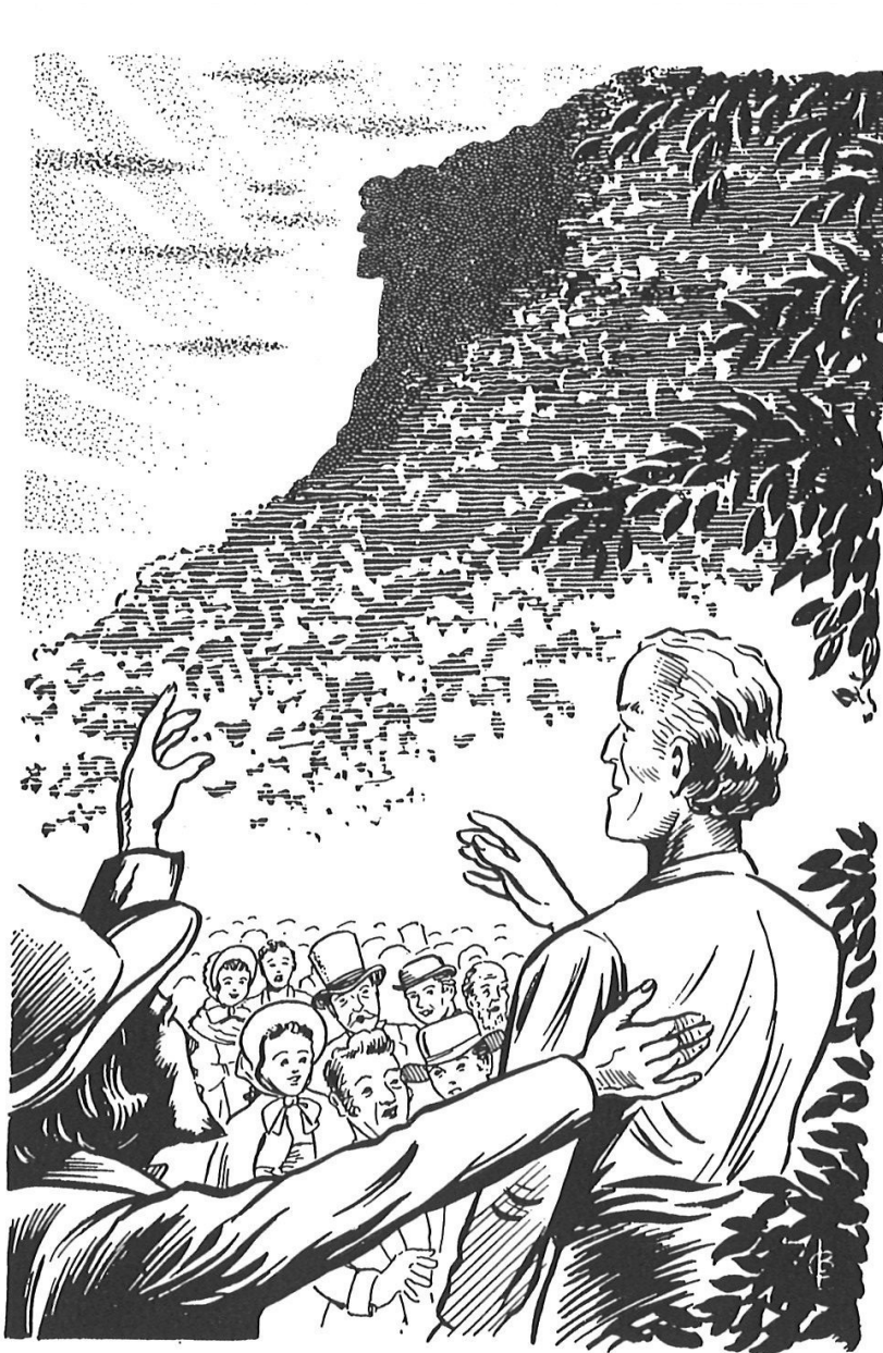
Ernest is recognized as the likeness

One day Ernest began to preach to the people a message in the open air. His words had power, because they accorded with his thoughts; and his thoughts had reality and depth because they harmonized with the life which he had always lived. It was not mere breath that this preacher uttered, but words of life, because a life of good deeds and holy love was melted into them. The poet, as he listened, felt that the being and character of Ernest were a nobler strain of poetry than he had ever written. At a distance, but distinctly to be seen, high up in the golden light of the setting sun, appeared the Great Stone Face. At that moment, in sympathy with a thought which he was about to utter, the face of Ernest assumed a grandeur of expression, so imbued with benevolence, that the poet, by an irresistible impulse, threw his arms aloft and shouted, "BEHOLD, BEHOLD. ERNEST IS HIMSELF THE LIKENESS OF THE GREAT STONE FACE."