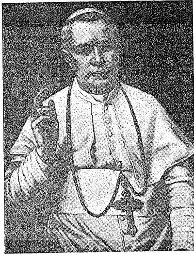
POPE PIUS X.