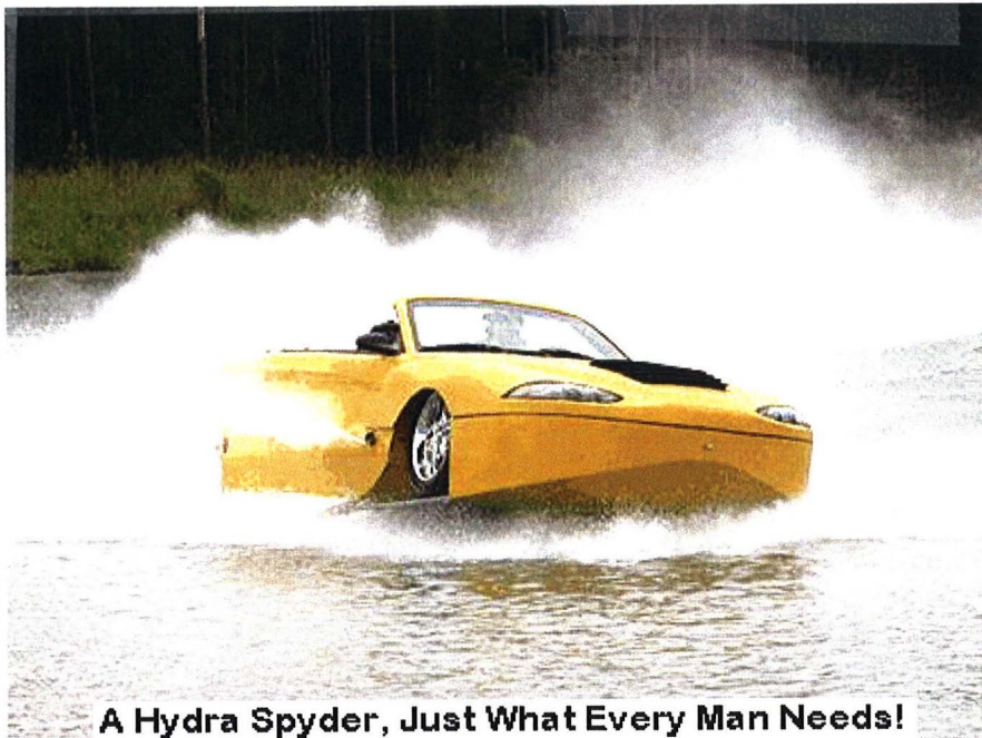
A Hydra Spyder, Just What Every Man Needs!

Americans, for the most part, enjoy a very high standard of living. Compared with people who live in other countries and people who lived in times past, Americans live as kings! We bathe in luxury every day. As one person has said, "The garbage disposal of most Americans eats better than do 30 percent of the people in this world." Yet, how sad that we carry a big share of the world's complaining! We have so much and appreciate it so little. God has blessed this land, but this land has forgotten to bless God. In what ways is America similar to the nation Israel (see Deuteronomy 8:7-18)?